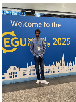
Figure 2: At the EGU General Assembly in Vienna.